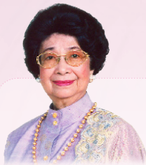
Honoured Patron Y. Bhg Tun Dr. Siti Hasmah Mohd Ali